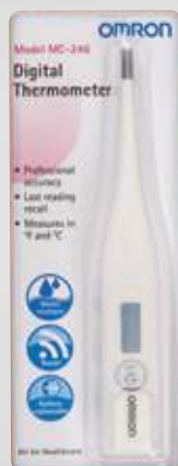
Omron + MC-246 Digital Thermometer