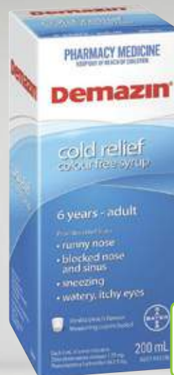
Demazin + Cold Relief Colour Free 6 Years - Adult 200mL

Prolonged exposure to cool air-conditioned aircraft cabins, luxury buses, or hotel rooms can result in your nose's cleansing and microbe fighting functions being adversely affected. This may mean catching colds more easily, so spoiling your holiday experience. FLO Travel with Carrageenan (extract of red seaweed) used regularly helps keep your nasal tissues moist throughout your travel. Flo Travel helps maintain the natural bug fighting and cleansing functions of your nose in tip top condition so you can enjoy your holiday.