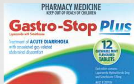
Gastro-Stop Plus + 12 Chewable Mint Tablets