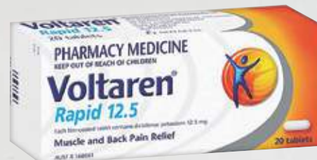
Voltaren μ Rapid 12.5 20 Tablets

Babies and kids have very narrow nasal airways which can easily become congested with excess mucus from colds and/or allergies. Washing excess mucus away with a sterile, preservative-free isotonic saline solution helps clear their noses within 5 minutes to improve breathing and help the child feed and sleep restfully. FLO Baby Spray and FLO Kids Spray can both be used at any angle making the treatment of your child comfortable, quick and easy.