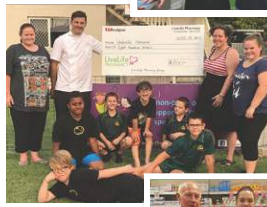
MyTime Group $800 - LiveLife Yeppoon & Gracemere