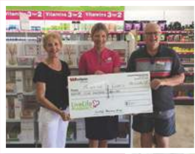
Meals on Wheels $500 - LiveLife Coolum Park