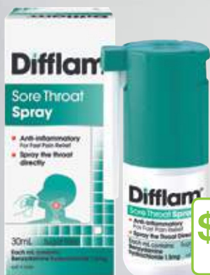
Difflam + Sore Throat Spray 30mL

μ Always read the label. Use only as directed. Incorrect use could be harmful. Consult your healthcare practitioner if pain or symptoms persist.