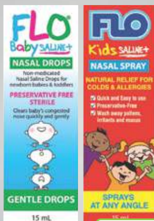
Flo + Baby Saline+ or Kids Saline+ Nasal Spray 15mL