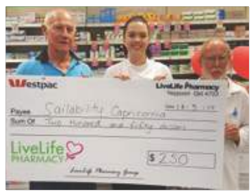
Sailability Capricornia $250 - LiveLife Yeppoon