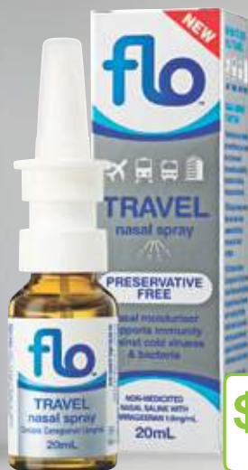
Flo + Travel Nasal Spray 20mL